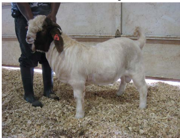
Buck # 47089 was the top-indexing, fastest growing, and eleventh-most feed efficient buck in the 2009 buck performance test.