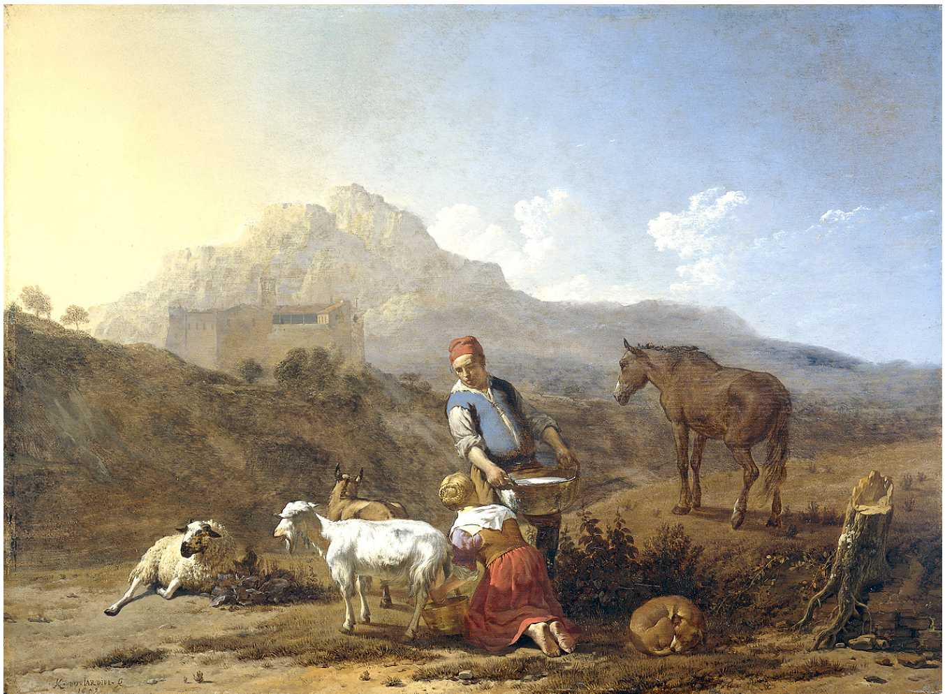
Italian landscape with girl milking a goat, 1652