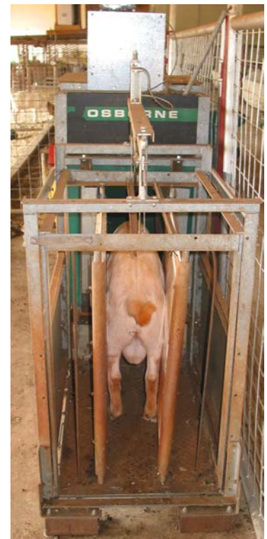
Bucks at the FIRE feeder.