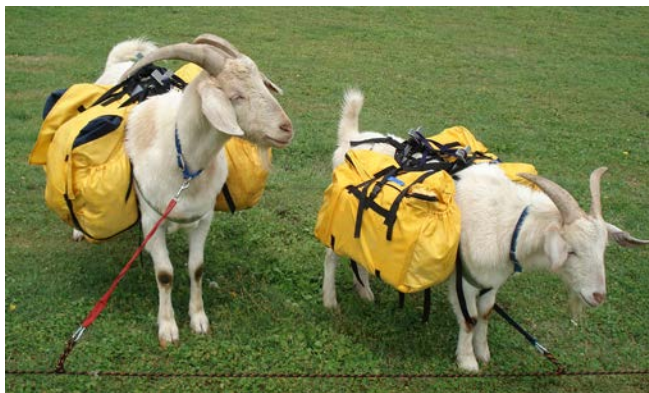
Pack goats ready to go.