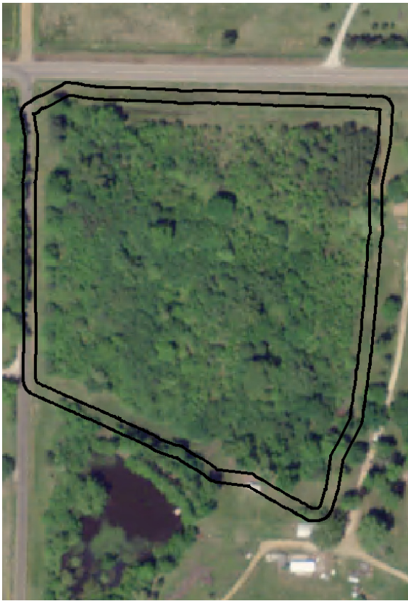
Demonstration plot at the Kiamichi Forestry Research Station. Inner line is fence line and outer is a buffer.

The control of invasive plant species in forests, especially pine forests, is costly for landowners to control and many landowners simply do no control measures. Therefore, the objective of the Renewable Resources Extension Act (RREA) project is to compare the biological treatment using goats in a pine forest to control invasive species with no treatment. This project has great significance in a variety of ways. It will allow the demonstration of using goats to return forest land to a state of economic benefit, apart from economic gains from goat production during the time of rehabilitation. Information will be gained concerning vegetation and soil fertility changes over the rehabilitation period.