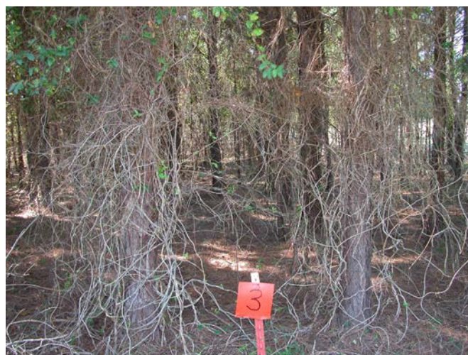
Plot 3 in 2008 (left) before the introduction of goats and after the 2009 grazing season (right).

For the 15 goats in 2009, a FAMACHA score, which is based upon the eye mucous membrane color, was evaluated at the beginning and end of the grazing season. Also, a fecal egg count was conducted on each goat at the end of the grazing season and those results are in the table below.