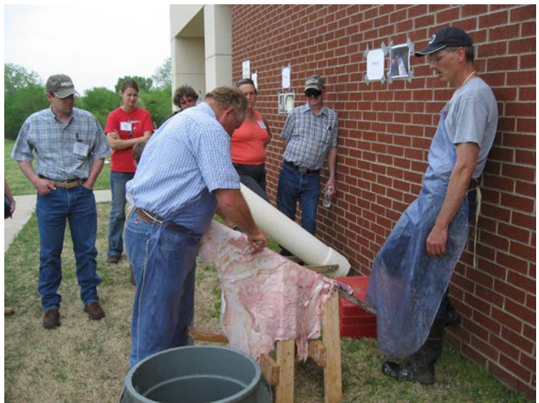
Fleshing at last year's Goat Field Day..

Have you ever wondered how to tan a hide? On Saturday, March 13, 2010, a tanning hides workshop will be held at Langston University from 8:00 a.m. to 12 noon. The focus of the workshop will be tanning hair-on hides but the process of dehairing hides and making leather and buckskin will also be discussed. After discussing the stages of tanning from how to handle and store a raw hide to softening and finishing a tanned skin, participants will have hands-on practice with goat skins in several of the different tanning steps. Participants can practice fleshing,