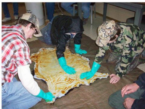
Liquid tanning method.

There is a registration fee of $10/person. Refreshments will be provided.