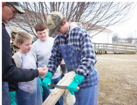
All ages are invited to attend the workshop.